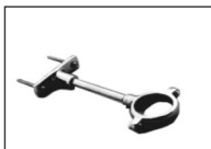
T46—Split ring wall support for flush connection