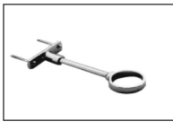
T36—Solid ring wall support for flush connection

P olished chrome plated flush valve, chloramine resistant Self Cleaning Bypass diaphragm, 3.5 gallons per flush, externally adjustable, with 1" vandle resistant capped screwdriver angle stop with back-check, sweat adapter kit, renewable main valve seat, metal "Rubberflex" oscillating handle, "Turn-to-Silence" equipment, with Slip-Joint adjustable tailpiece, vacuum breaker, wall flange, spud nut and spud flange for 1½" top spud.